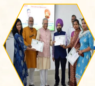
Hindi Pakhwada Celebrations