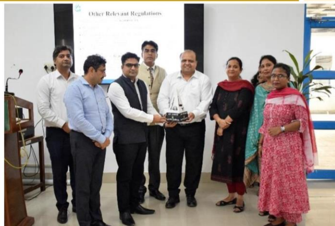
Glimpses of the felicitation ceremony