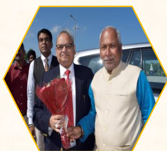
NAAC Peer Team Visit at CUPB