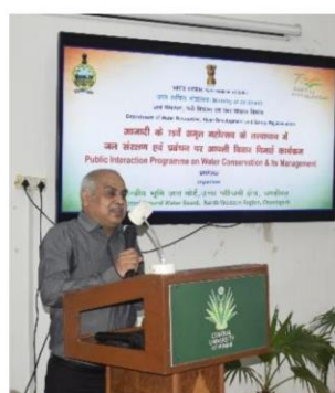
Shri Dinesh Tiwari addressing the participants

in several states of India. The state of Punjab, where surface water and groundwater were abundant a few decades ago, is currently facing a scarcity of freshwater. He stressed the need for conservation of water and made an appeal to youngsters to think about new ideas for making India a water-secure state.