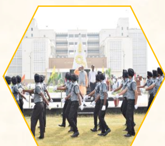
76 th Independence Day Celebrations