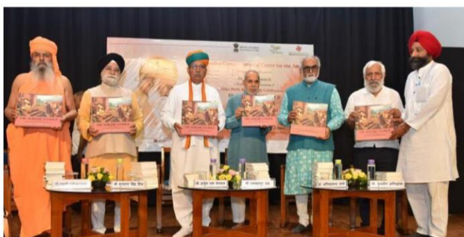
Union Minister of State Arjun Ram Meghwal releasing 11 books focused on life and teachings of Sri Guru Nanak Dev Ji

The Hon'ble Union Minister of State for Culture and Parliamentary Affairs, Shri Arjun Ram Meghwal, released 11 books that focus on the life, philosophy and teachings of Sri Guru Nanak Dev Ji, published by the Indira Gandhi National Centre of Arts (IGNCA), during a programme held in New Delhi. Of these eleven books, the authors/editors/translators of the above five books belong to the Central University of Punjab, Bathinda.