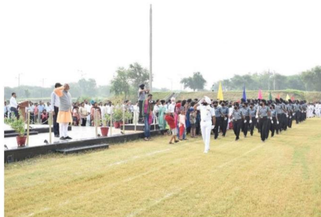
Glimpses of Inspection of Parade Ceremony at CUPB on 76th Independence Day

that their future generations could live in an independent country following our ancient knowledge traditions and philosophy of Sarve Bhavantu Sukhinah. He explained the significance of the tri-colour in Tiranga, with a saffron colour band on top representing our country's strength and courage, a white colour band in the middle representing peace and truth, and a green colour band at the bottom representing fertility and growth. He asserted that every citizen should live his/her life based on the 24 principles depicted by the 24 spokes of Ashok Chakra placed at the centre of our National Flag, which signifies that there is life in movement and death in stagnation.