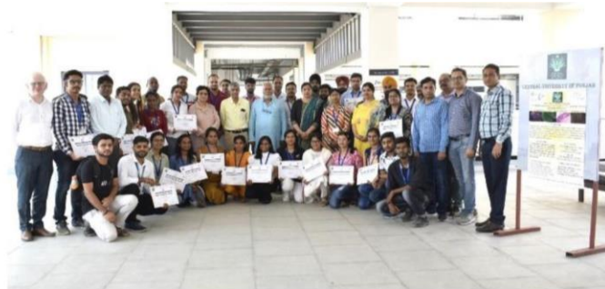
Group Photograph of Participants and Organizers of the programme