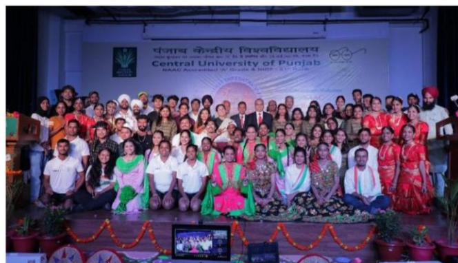
Group Photograph of CUPB Students and NAAC Peer Team Members during Cultural Evening Programme

glimpses of Ek Bharat Shreshtha Bharat by displaying mesmerising performances of their respective cultures.