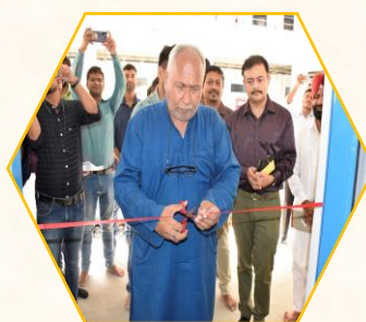
Education Studio launched at CUPB