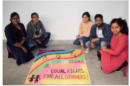
August 18, 2022: Students participating in poster making competition organized by Gender Sensitization Cell on the topic "Euqal Rights for All Genders"