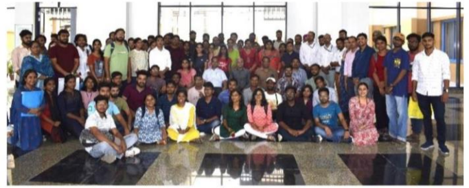
Group Photograph of participants with esteemed guests

Environmental Science and Technology, shed light on the arrangement of water conservation facilities at the