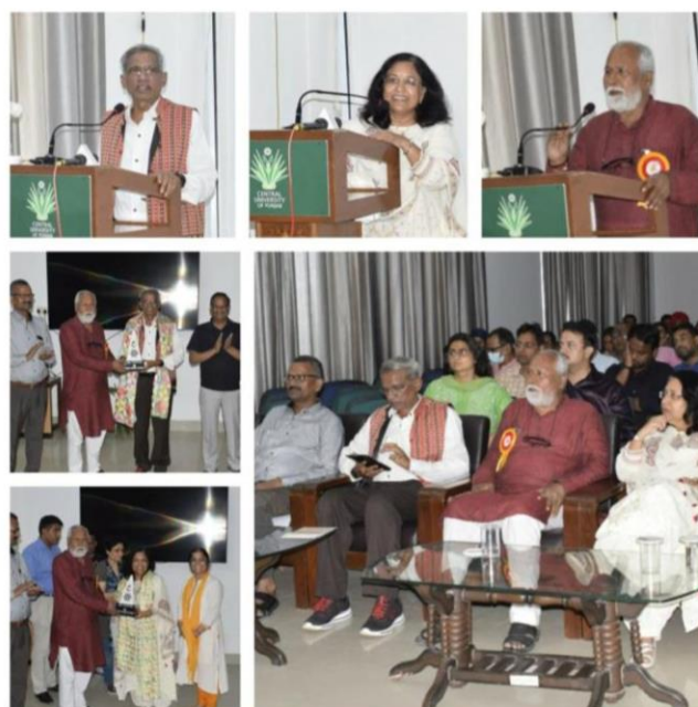
Photo Collage showcasing glimpses of the programme