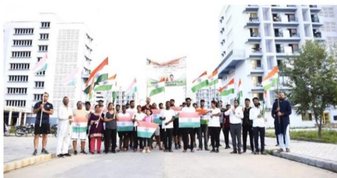
Glimpse of Har Ghar Tiranga Prabhat Pheri at Central University of Punjab Campus

The objective of these activities was to instil the feeling of patriotism in the hearts of people and reminisce the journey of India and those who have contributed towards this great nation.