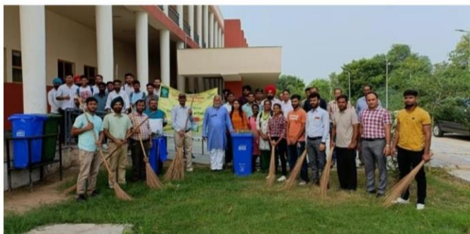
Glimpses of Swachhta Drive