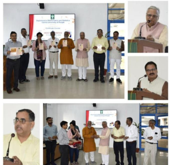
Glimpses of Inaugural Ceremony of Introduction of Certificate Course in Vedic Mathematics programme

rapidly emerging as tools for students appearing in various competitive examinations where speed plays an important role and that this programme will help students do complex calculations mentally (without using pen and paper) within a fraction of seconds.