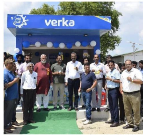
Group Photograph of University Officials and Verka Representatives