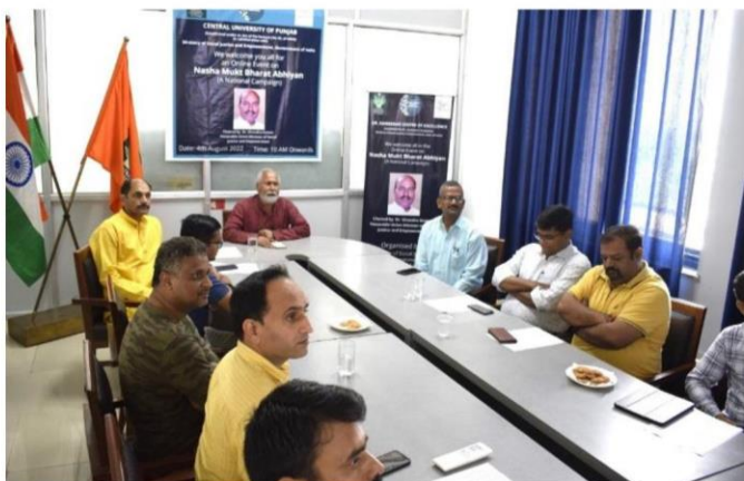
CUPB V-C and University Officials attending the programme

work together to eradicate drugs from our society and create a Nasha Mukta Bharat.