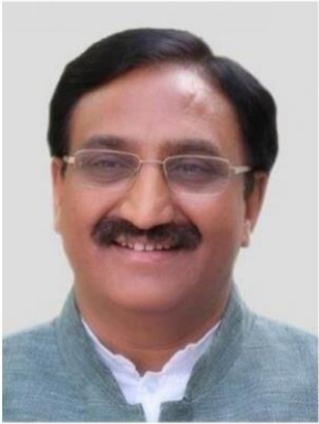
पूर्व केन्द्रीय शिक्षा मंत्री श्री रमेश पोखरियाल 'निशंक'