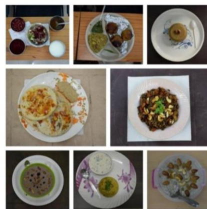
Photo Collage of Recipe prepared from Millets