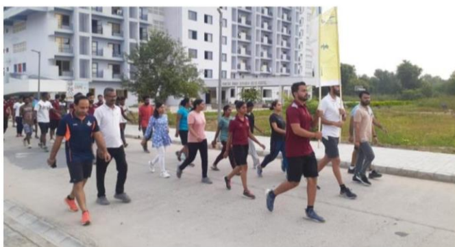
Glimpses of Fitness Walk

Swachhta Walk on September 14, 2022: More than 50 CUPB faculty and students participated in Fitness Walk held from University Hostel Main Gate to Sports Ground.