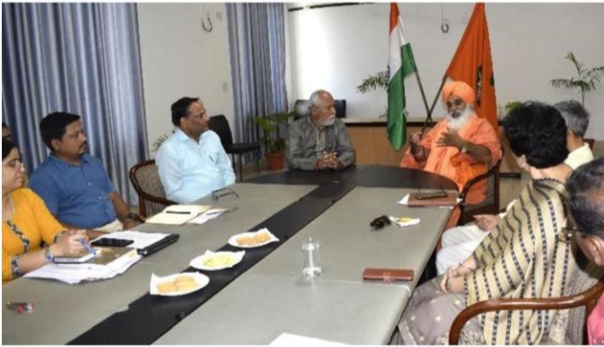
Sant Balbir Singh Seechewal interacting with CUPB faculty members

While interacting with faculty and officers of the university in a special interaction session, Sant Balbir Singh Seechewal stated that clean air, clean water and clean food are the fundamental rights of every citizen. However, the contamination of harmful pollutants in air, water, and soil causes not only environmental destruction but also a rise in global temperature.