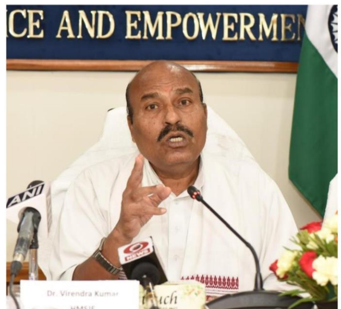
Hon'ble Minister of Social Justice and Empowerment Dr. Virendra Kumar addressing the participants