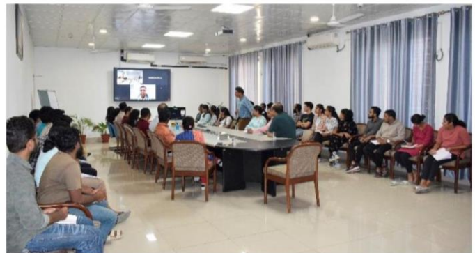
CUPB fraternity attending the programme

insurance. The lecture session was followed by a Q&A session.