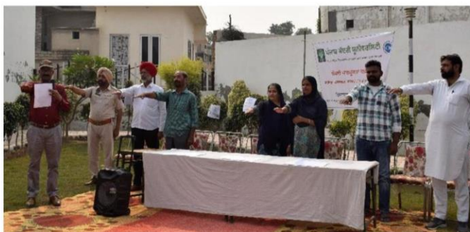
Registrar Prof BP Garg administering Integrity Pledge to members of Ghudda Gram Panchayat and Villagers

The objective of this programme was to encourage civilians to individually and collectively contribute to the prevention of corruption and malpractice and to raise public awareness regarding the existence, causes, and consequences of corruption and unethical conduct.