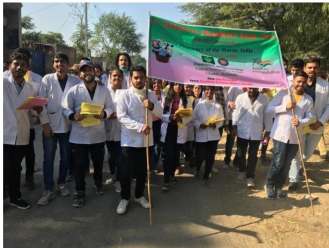
Students participating in sanitation programme organized under CUPB Pharma Week Celebrations

On day 4th, the students visited Naruana village to create awareness towards dengue and chikungunya awareness. To address the awareness, the students made posters/playcards and took out a rally in villages. Students and faculty members interacted with villagers and told them the measures to stop the spread of dengue and chikungunya.