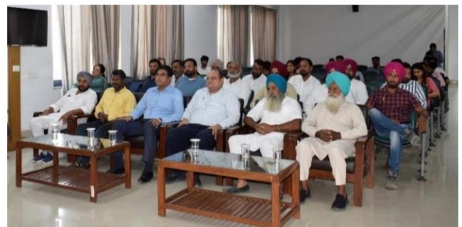
CUPB fraternity and residents from Village Ghudda attending the programme