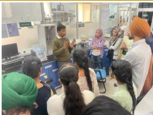
35 students from Baba Farid College from BSc Biotech and MSc Zoology and MSc Botany visited CUPB