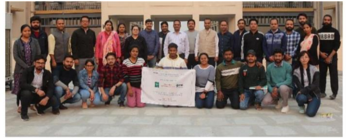
Group Photograph of Participants