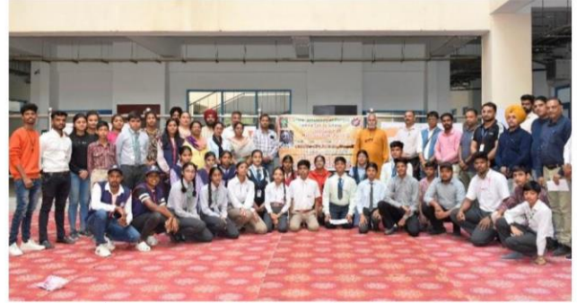
Students from across Bathinda participating in District Level Poster Making Competition held on Rashtriva Ekta Diwas

October 7, 2022: An Awareness Lecture on Road Safety held at Central University of Punjab