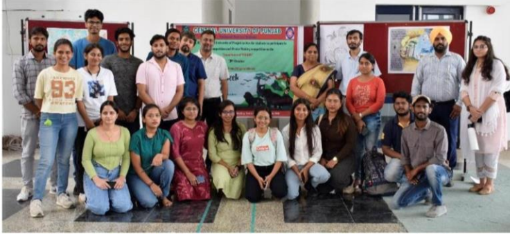
Students participating in Poster Making Competition on the theme Importance of Wildlife

CUPB Students exhibited their artistic skills during Poster Making Competition organized on Wildlife Week Celebrations and Rashtriva Ekta Diwas