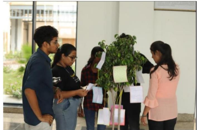
Students reading the experience notes written by others

"Horegallu" was another event organised by students as part of World Mental Health Day. It provided the participants with a platform to share the toughest phase of their lives and how they have overcome it while maintaining their anonymity. They have written about their experiences on cards that were displayed. This was an attempt to strengthen others who were going through similar experiences.