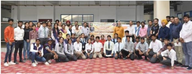
Group Photo of participants of Poster Making Competition along with CUPB Vice-Chancellor

refraining from injuring living beings, purity, goodwill, mercy, patience, forbearance, self-restraint, generosity, and asceticism. Our country's economy has been dependent on self-reliant villages since times immemorial and the entire world has learnt lessons from the Bharatiya Way of Living Life during the times of COVID-19.