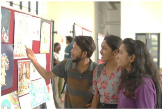
Students taking a glance at the paintings displayed in the Exhibition