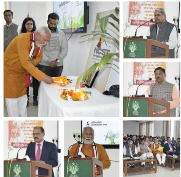
Photo Collage of Glimpses of the programme