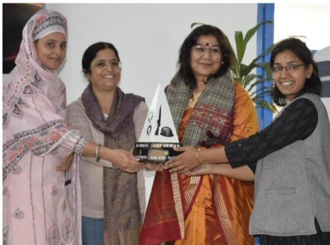
CUPB officials and faculty felicitating the invited speaker