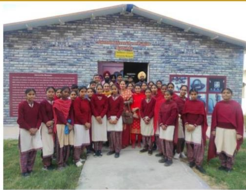
45 students of class 9 th and 10 th standard and from Information Technology and Agriculture along with 05 teachers from GSSS, Banbhaura, Sangrur visited the university