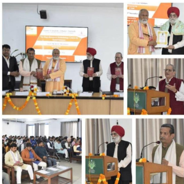
Photo Collage of the Glimpses of Inaugural Ceremony memorable moments

individual identities. He urged researchers to use a Bharat-Centric research methodology that is based primarily on observations and imperial evidence.