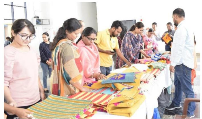
CUPB students and faculty attending the exhibition