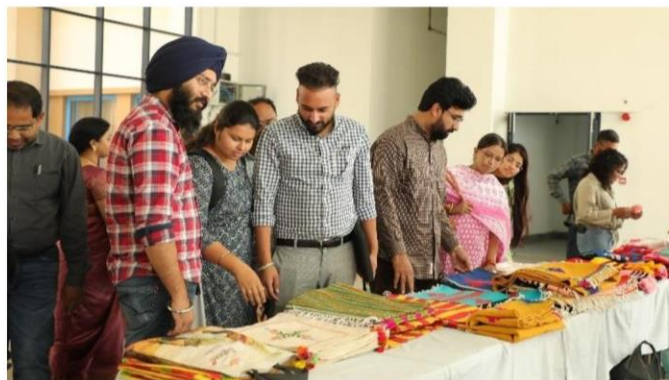
CUPB students and faculty attending the exhibition

The Institution Innovation Council (IIC) of Central University of Punjab, Bathinda organized a one-day exhibition-cum-sale of handicraft items crafted by the women of a self-help group from Bathinda as a part of National Innovation Day celebrations. The programme is co-organized by women's self-help group named Virasat, based in Buladewala Village in Bathinda district and is supported by Ambuja Cement Foundation.