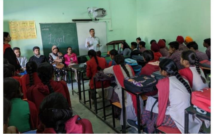
CUPB faculty sensitizing students under Constitutional Literacy Campaign,

As a part of the Constitutional Literacy Campaign, the faculty, research scholars and students of the Department visited eight schools (Government Senior Secondary School, Village-Ghudda; Shaheed Karam Singh Govt. Senior Secondary School, Village, Naruana; Government Sports Senior Secondary School, Village, Ghudda; Punjab School Education Board Adarsh Senior Secondary School, Village- Nandgarh; Government Senior School, Multania; Sipahi Jaila Singh Veer Chakra Govt. Senior Sec. School, Sangat; Govt. Senior Secondary School, Kaljharani; and RBDVA School) to sensitize the young minds from 9th Std. to 12 Std. about the meaning of Preamble, Fundamental Rights, Fundamental Duties and Directive Principles.