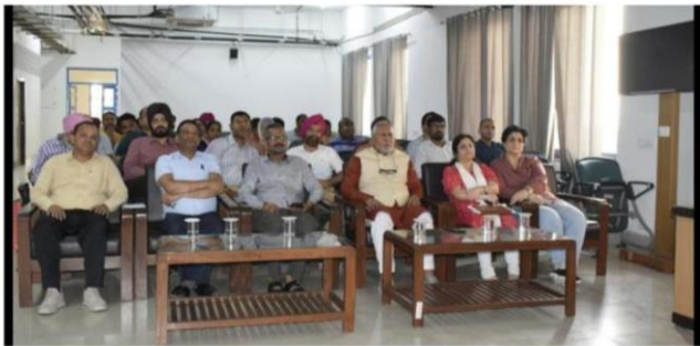
CUPB faculty attending the inaugural ceremony of the launch of draft NCrF by Union Minister of Education Shri D Pradhan

Speaking on the occasion, Shri Pradhan stated that the National Credit Framework is a next generation, multidimensional instrument under the NEP to empower students and youth. We are dedicating NCrF to 'Jan-paramarsh' to make it more dynamic. Shri Pradhan further said that the National Credit