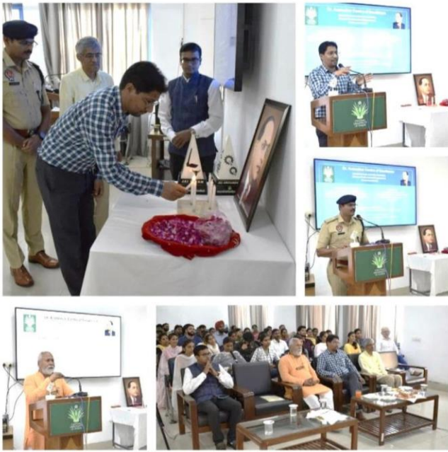
Photo Collage of the Glimpses of the programme