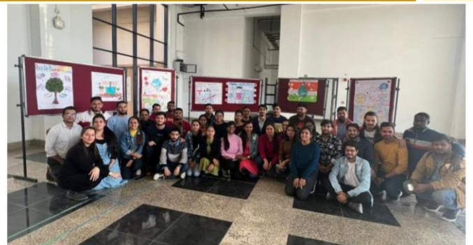
Group Photograph of participants of Poster Making Competition

On the 1st day of celebrations, around 16 teams participated in Poster Making Competition and demonstrated poster on the theme of Pharmacy of the world-India.