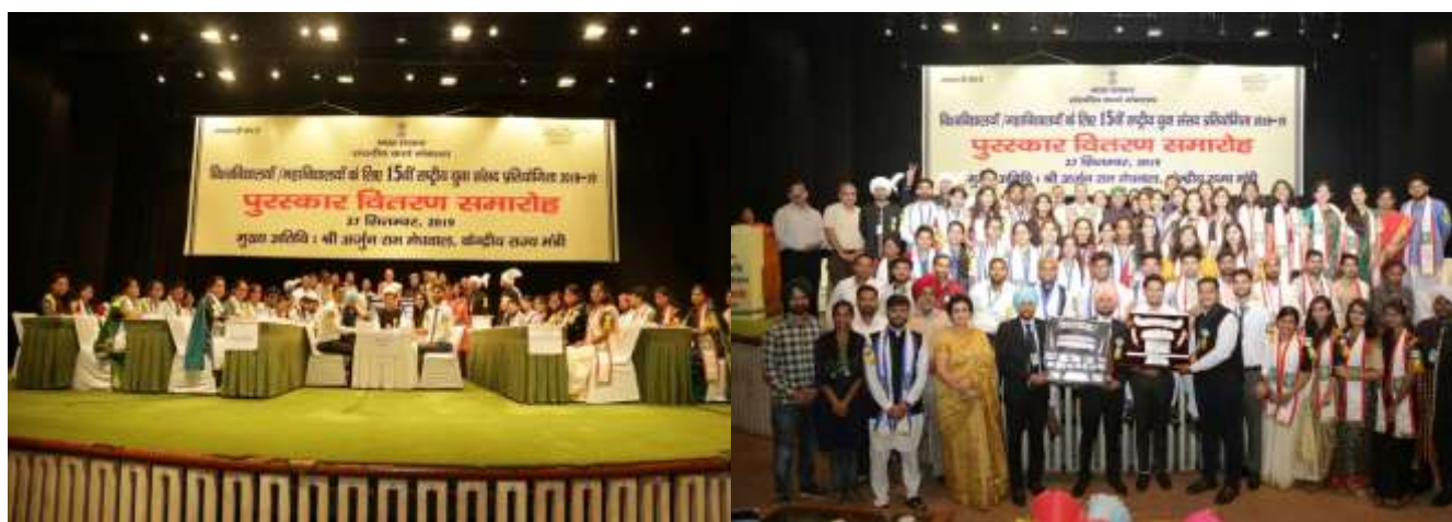
CUPB Students performing Mock Parliament at the Award Ceremony of 15 th NYP in Parliament House