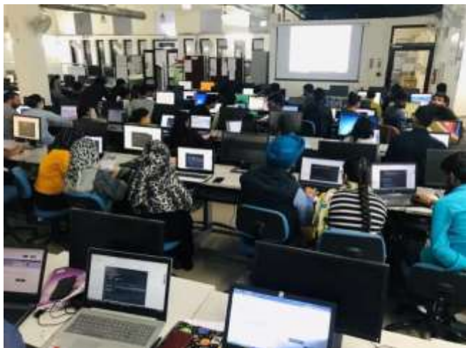
CUPB Students attending the workshop