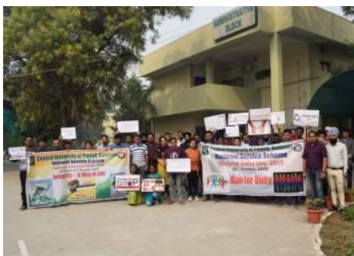
Group Photograph of CUPB students and faculty members at the start of Unity Walk

The programme started with the Walk for Unity, in which more than 150 students & faculty members walked together around the campus. After this, all the participants took the Integrity Pledge & Vigilance Awareness