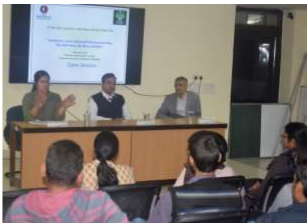
Experts interacting with participants during the Open Session