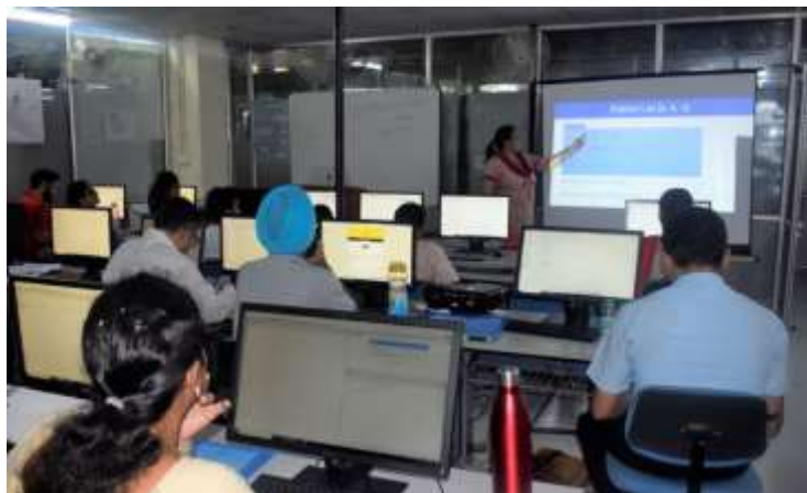
Resource Persons teaching Python Applications to participants