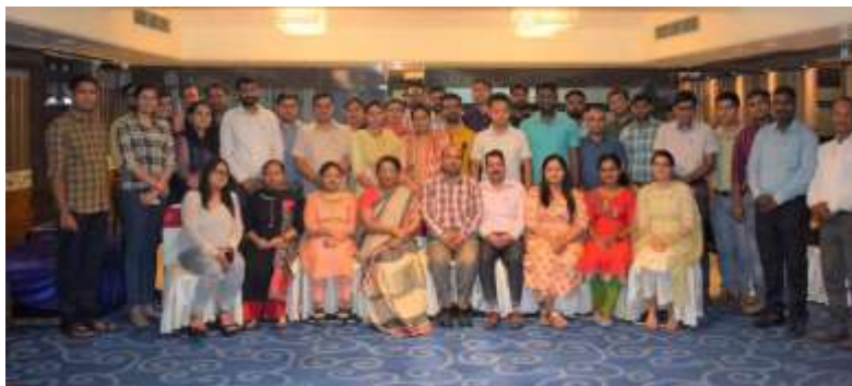
Group Pic of participants of 13th June to 12th July FIP Workshop