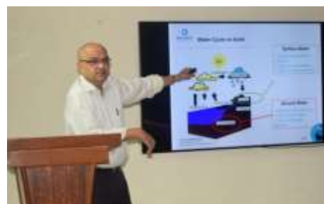
Resource Person presenting a slide to participants

The Central Instrumentation Laboratory (CIL), Central University of Punjab (CUPB) organised a one-day workshop on “Water Quality and Filtration Practices in Laboratory ” on 26 th September at its city campus. The program was organised in collaboration with Klorofil Scientific. The objective of this workshop was to spread awareness about the quality of water and essential filtration systems to be used in laboratories during various analytical procedures. Faculty Members, Research Scholars and Students from different departments actively participated in this program.