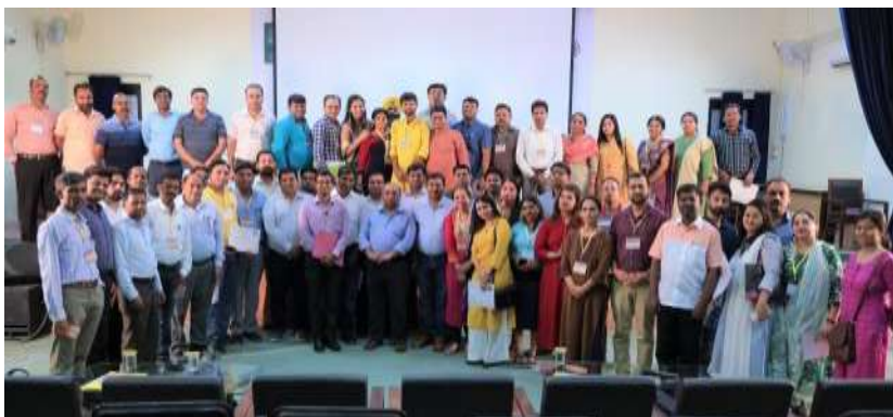
Group Photo of Participants in TLC Workshop in Political Science and Sociology