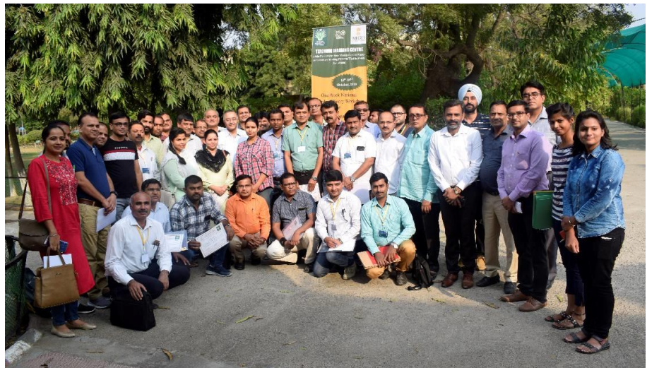
Group Photograph of Participants and Organizing Team Members