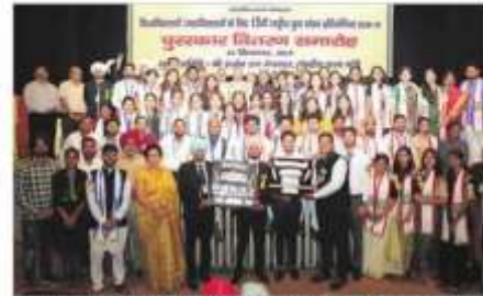
Students of the Central University of Punjab, Bathinda, at Parliament Library building in New Delhi.