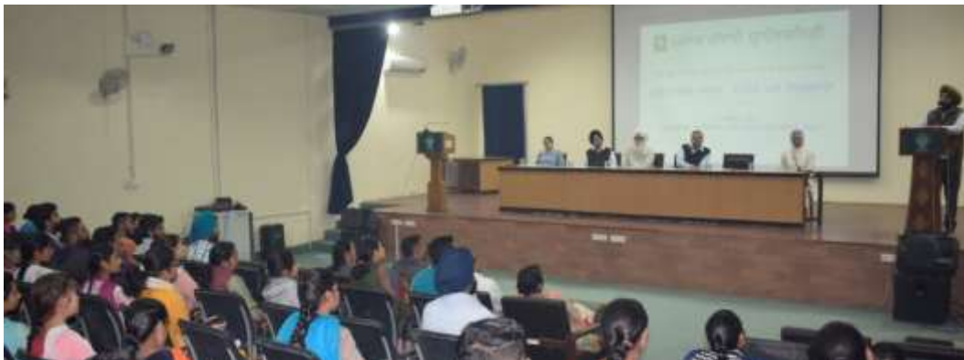
Expert Speakers addressing the gathering

Dev Ji. He stated that Shri Guru Nanak Dev ji is the founder of the modern-day Sikhism and is the first guru worshipped by Sikhs across the world. He shared the life journey