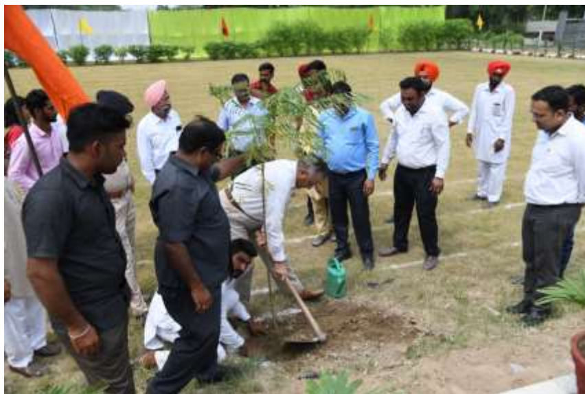
VC Prof RK Kohli Planting Tree Sapling in CUPB Main Campus

The NSS Wing of the Central University of Punjab successfully organised various activities under Swachhhta Pakhwara Programme from 1 st to 16 th August. Under this programme, different activities like swachhhta pledge, cleanliness drive, tree plantation, debate competition on the topic “Impact of Swachh Bharat Abhiyan” etc. were held. The objective of these activities was to spread awareness among youngsters regarding the importance of cleanliness of surroundings, open defecation free country