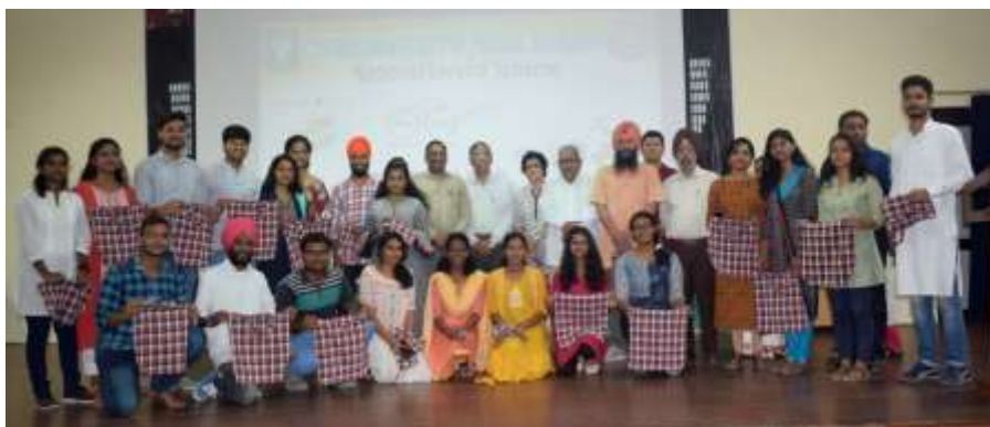
CUPB NSS Volunteers appeal to use Jute / Cotton Bags