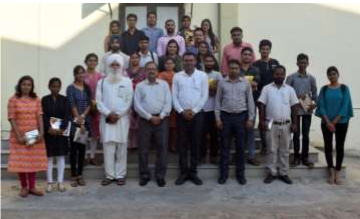
Group Photograph of Hindi Pakhwara Prize Winners