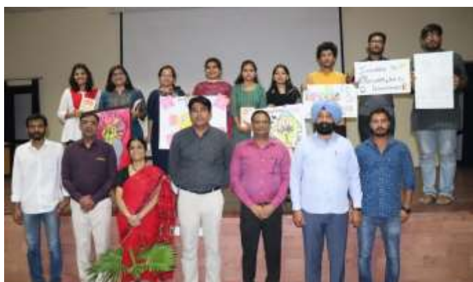
Group Photograph of Competition Winners and CUPB Faculty Members