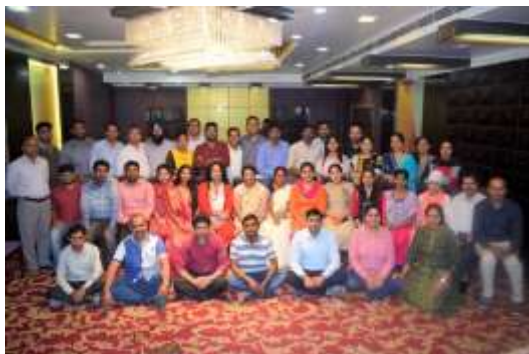
Group Pic of participants of 4th June to 3rd July FIP Workshop

they yielded from these workshops. Organisers thanked the participants for their sincere association and making these programmes a huge success.