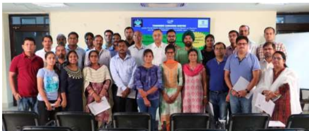
Group Picture of participants of TLC Workshop on Environmental Science