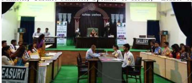
CUPB Students performing in National Youth Parliament Final Round