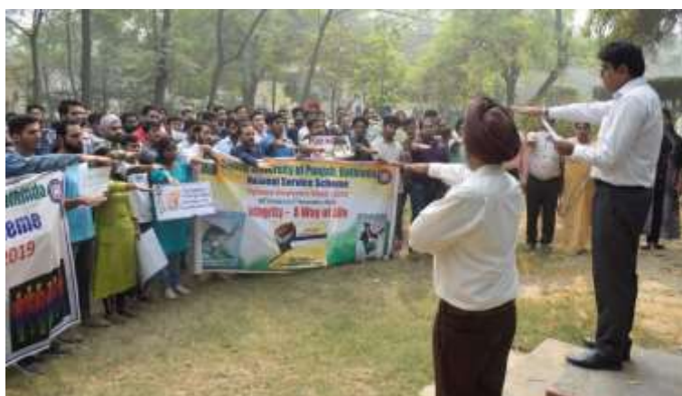
CUPB students taking Integrity Pledge and Vigilance Awareness Pledge

As per directions of Central Vigilance Commission, NSS Cell, CUPB organized various programmes at City campus of Central University of Punjab, Bathinda during the observance of Vigilance Awareness Week-19 from 28 th October to 2 nd November 2019. On 31 st October, an Awareness March was organised in the city campus of CUPB on the eve of Vigilance Awareness Week-2019, where NSS volunteers prepared Placards / Slogan and displayed it during the Awareness Walk. NSS Volunteers, Students, Faculty & Non-teaching staff participated in this Programme. During this programme, more than 150 participants also took Integrity Pledge under the directions of Dr Tarun Arora, Associate Dean Students Welfare. The program was successfully ended with a formal vote of thanks by Sh. Kanwal Pal Singh, Registrar of Central University of