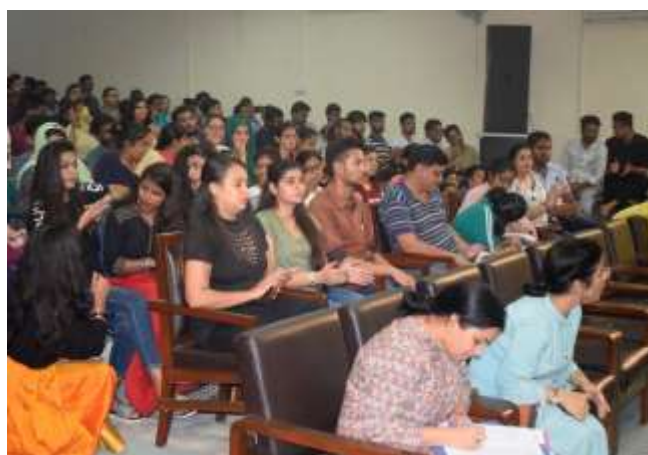
CUPB Students attending NSS Day Celebrations Programme

The special attraction of CUPB NSS Celebrations was Cultural Program, in which NSS Volunteers and Students from different states in which they presented beautiful folk dance & cultural performances. On this occasion, NSS Volunteers, CUPB Faculty, Staff members and students were present.