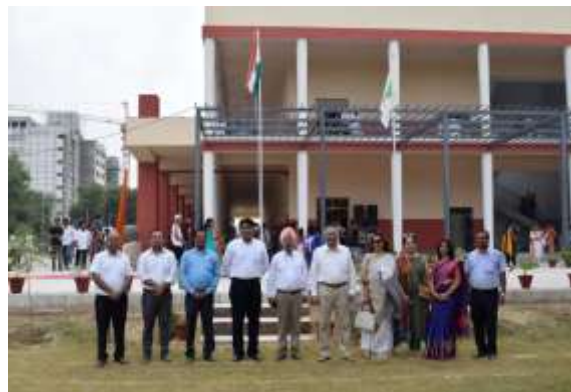
Group Photograph of CUPB Authorities with National Flag