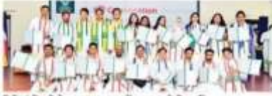
डिग्री विषयों के श्रेष्ठ छात्रों को पेंटेंट डिग्रीट के अवसर पर