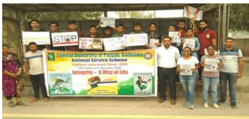
CUPB NSS Team during the Awareness Walk & Pamphlet Distribution Activity at Civil Hospital, Bathinda

On the third day, i.e. 2 nd November 2019 an awareness march (Rally) was organised in Bathinda City from Civil Hospital Bathinda to Hazi Rattan Chowk, Bathinda. The NSS team started the walk from